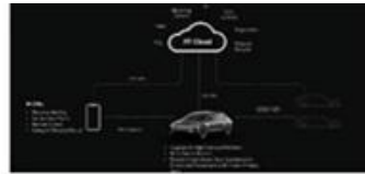
I.A.I Software, Cloud & AI